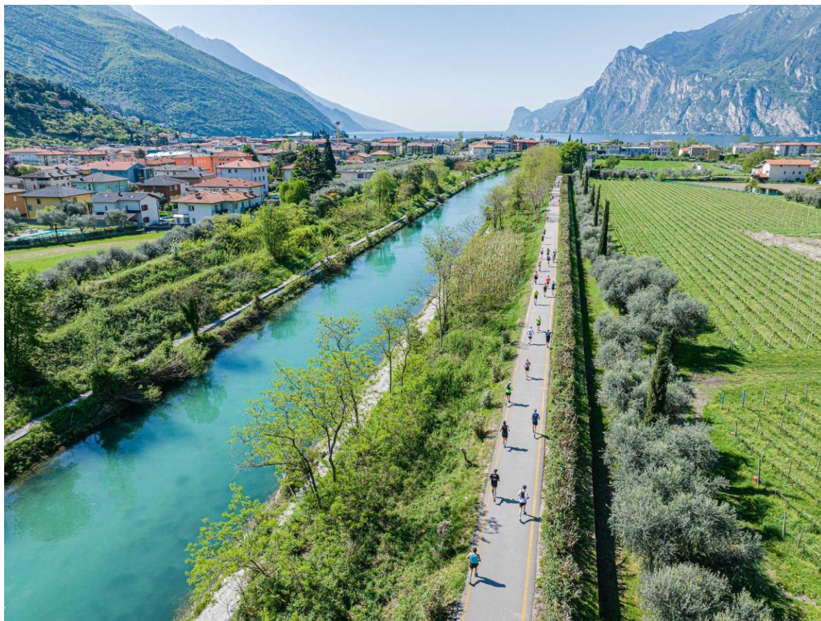
LAKE GARDA 42

REGISTRATION IS OPEN, 5.000 BIBS ARE AVAILABLE