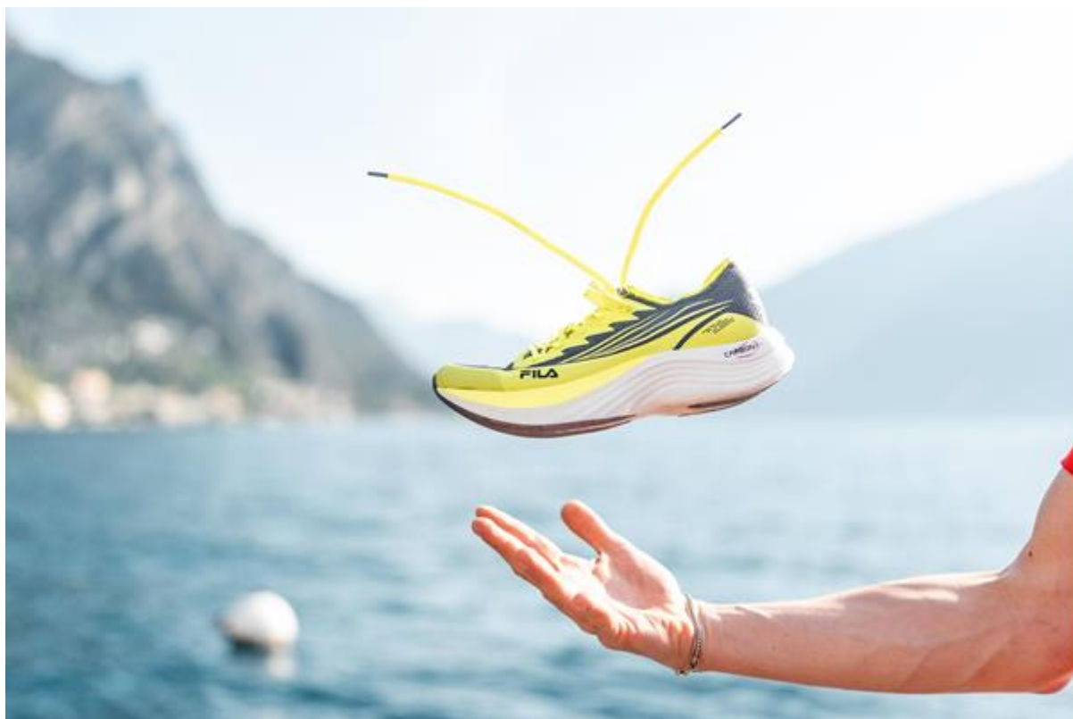
LAKE GARDA 42

The running event that in the last few years has gathered thousands of running enthusiasts at Lake Garda will be back in 2025 with important news, starting with the new title sponsor FILA, the historic brand that for years has contributed to spreading the image of Italian design also in sports clothing and equipment. From next year's edition the event will be called FILA LAKE GARDA 42 and will offer the traditional LG42 marathon and LG21 half marathon, which will take place on Sunday 6th April. In the wake of past editions, the entire weekend will be marked by an agenda of side events that for three days will transform the northern shores of Lake Garda into the location of a true running festival. The routes of the two main races will also remain unchanged: the LG42 marathon will start from Limone sul Garda, pass through Arco and Riva del Garda in Garda Trentino, and arrive in Malcesine. Likewise, Arco di Trento and Malcesine are confirmed as the starting and finishing line of the LG21 half-marathon, respectively.